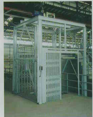
Goods lift with KÜHNEZUG hoists also for explosion-proof requirements

KÜHNEZUG truck mounted crane "Jonny from Hamburg" produced for more than three decades