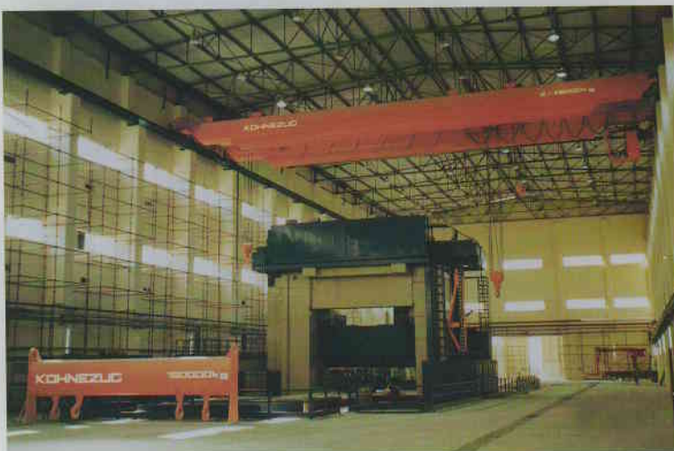
KÜHNEZUG double oval girder travelling crane up to 500 t loading capacity

OVALplus* travelling cranes up to 20 t loading capacity and 50 m span