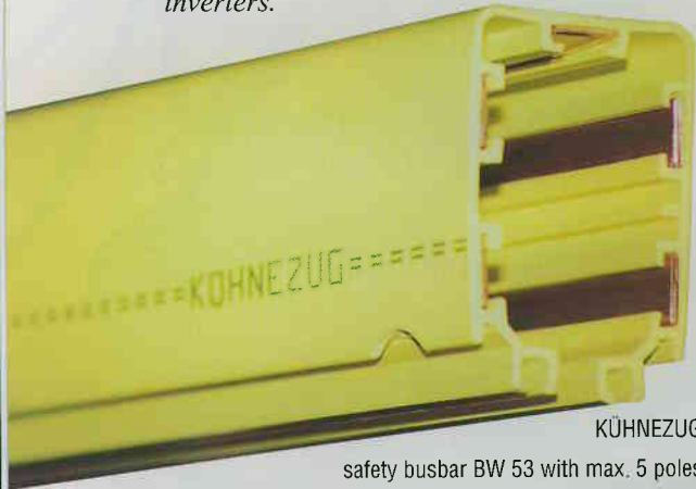
KÜHNEZUG safety busbar BW 53 with max. 5 poles

Control can either be performed by contactors, semi conductors or frequency inverters.