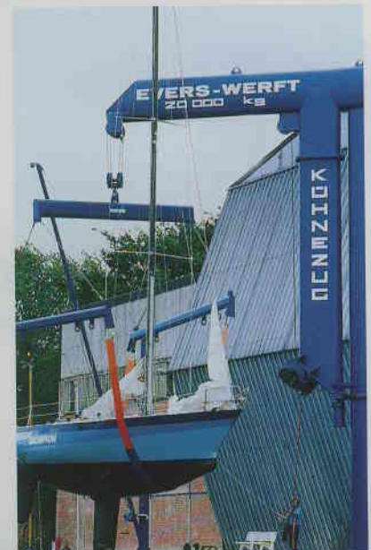
Owners of Admiral's Cup Yachts have trusted for years in oval girder slewing cranes for shipyards and marinas

We are looking forward to discussing the configuration of your hoisting equipment with you individually