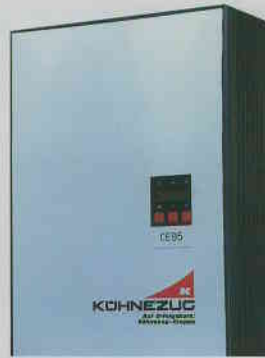
KÜHNEZUG SOFTDRIVE* the frequency inverter with current regeneration