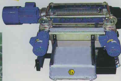
KÜHNEZUG Hoist EEx-d short headroom trolley for all explosion groups and temperature classes